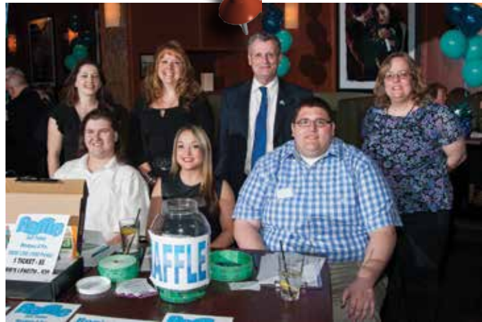
Graduates of the CIS and related programs gather for their 5th annual mixer