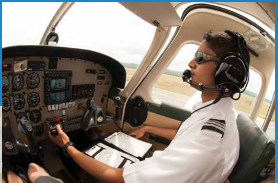
Taking off from the Wilkes-Barre/Scranton International Airport