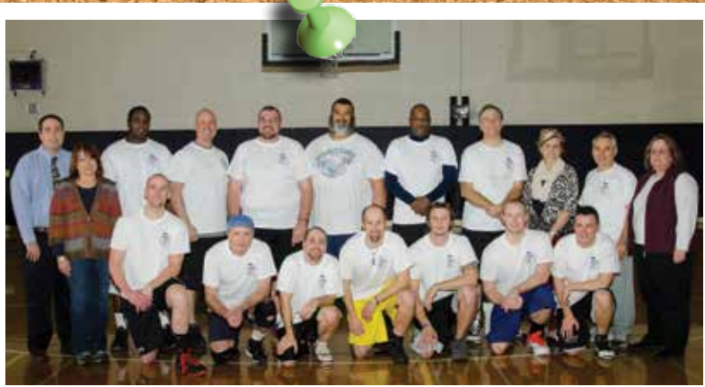
Alumni team from this year's Alumni v. Student basketball game