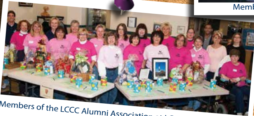
Members of the LCCC Alumni Association at LCCC's Craft Festival