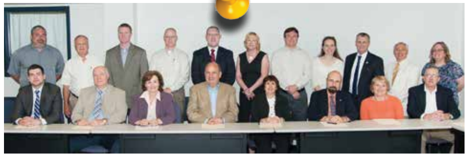
Members of the LCCC President's Alumni Advisory Council