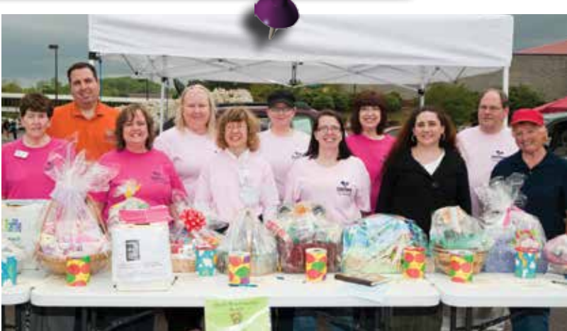
Members of the LCCC Alumni Association hold their basket raffle during the Annual Flea Market and Collectibles Show