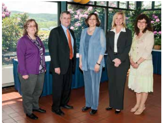
LCCC's annual Dental Health Alumni Day