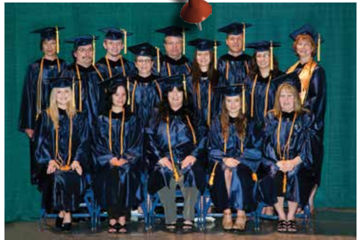
College's summa cum laude graduates in attendance at LCCC's Commencement ceremony